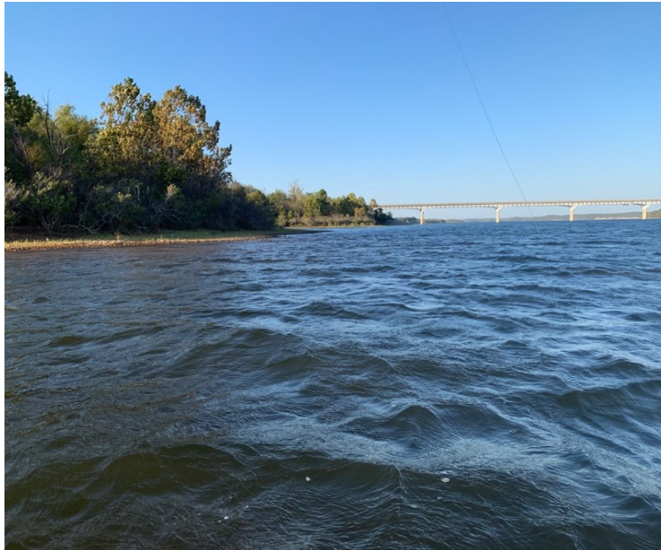
Stockton Lake Twin Bridges: lake level 866ft, most of the beach under water

I started fishing with significant white caps on the lake moving parallel to the beach, not ideal. The west wind was not favorable for the twin Bridge beaches. There were a few winds gust exceeding 30 miles per hour, ripping the water off the lake surface. I fish jumping about, and I was picking up a few white bass and blue gill. The wind deceased late afternoon and the lake was flat when I left after sunset.