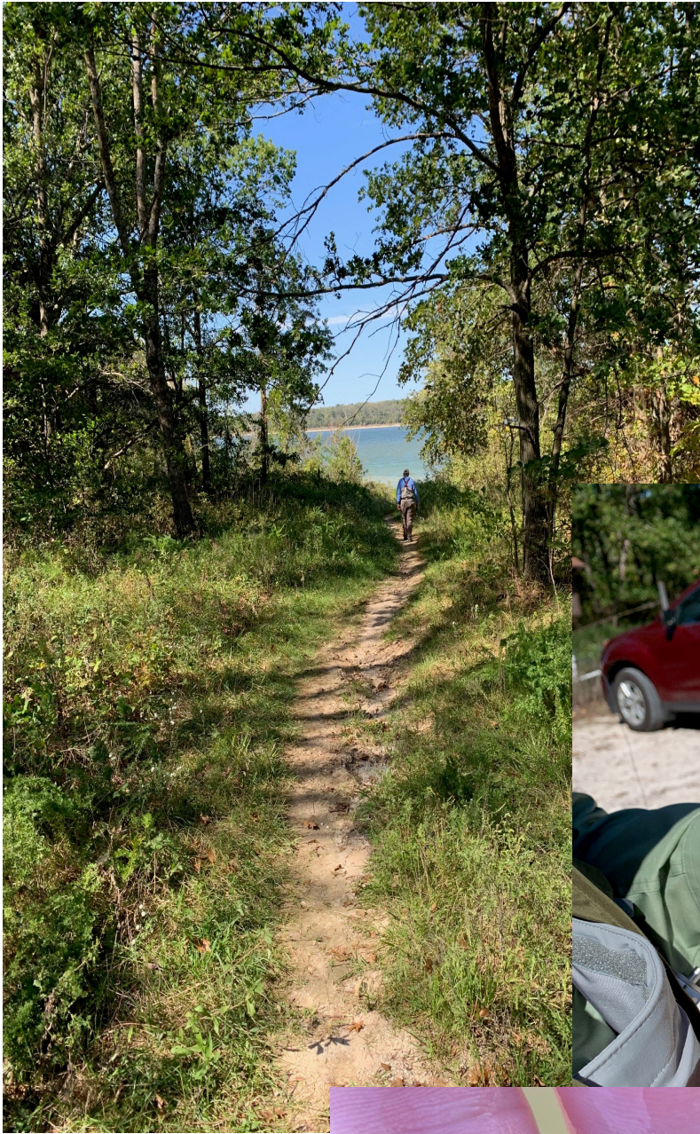
View from the parking lot and walking to Stockton Lake.