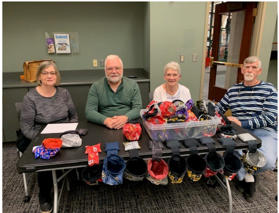
Our friends from the Bennett Springs Fly Tying Club.