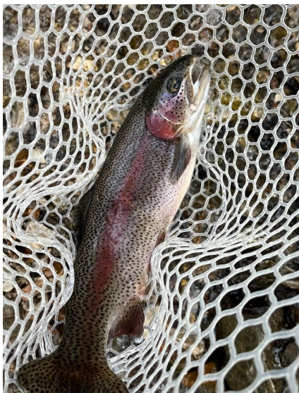
Getting ready to fix fish ladder

Mike Kidd: "Taney is extremely crowded currently." "Pellet fly with hares ear dropper is productive, sculpins are working stripped slowly."