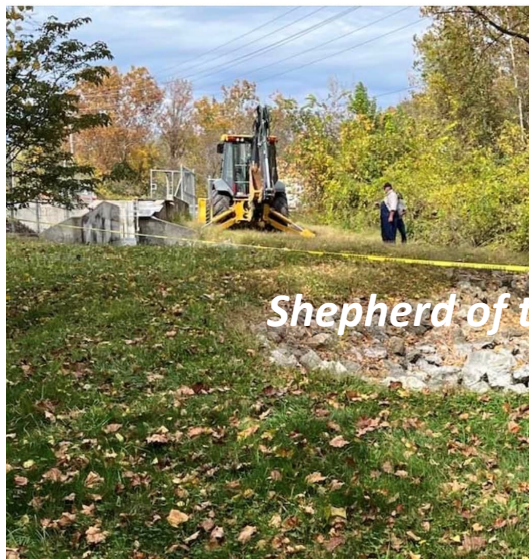
Shepherd of the Hills Fish Hatchery