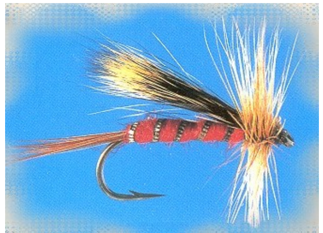
An alternate color/material combination.

Red worsted from a rug for a body and a bunch of hair from a red spaniel dog, put together with a squirrel tail hackle in the spirit of fun on an over-size muskie hook, and presented to Mr. Trude, looked so good that a few more serious samples were made up with a red yarn body wrapped with silver, squirrel hair tied long enough to show the dark band, and red rooster hackle. They caught all the fish the party could carry away from the Snake River, near the ranch. http://www.flyangleronline.com/features/oldflies/part231.php