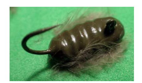
Don't want to tie your second fly off the hook, then tie on an extender like this,