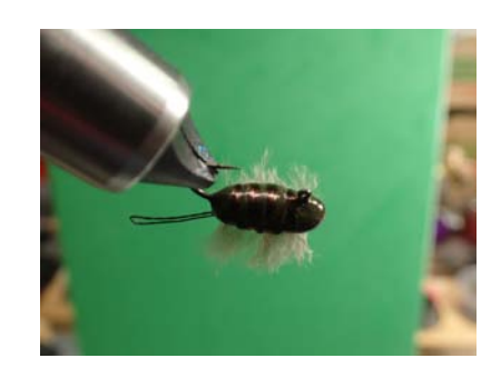
Here is the epoxy and braided line I used.