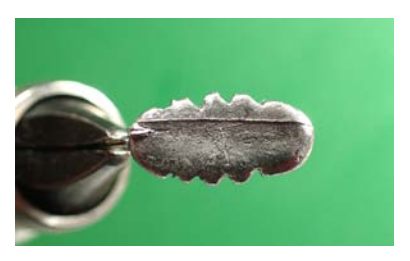
Instead of using slit shots to get your fly to bottom, use this sowbug and tie your second fly off the sow bug hook. Now you might have twice the success of catching the fish.