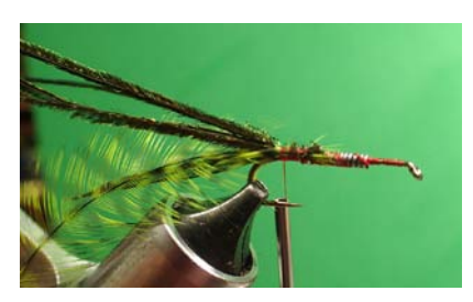
Tie in your hackle feather and 4 peacock herls.