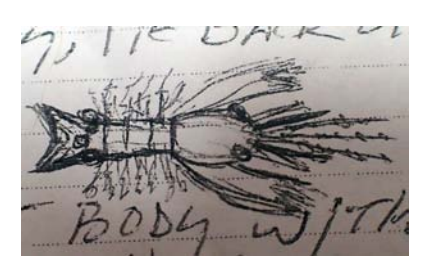
Male versus female craw and molting craw Bass and Trout Prefer:

Pull the body over dumbbell eyes; pull the eye through the slit that was cut into the ultra suede. This way the tail can retract under the dumbbell eyes when craw is pulled. Use a permanent marker to rough up colors.