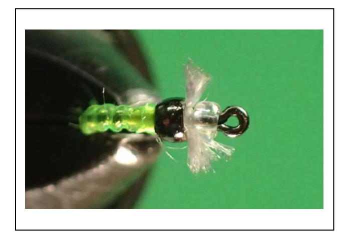
The gills are on the side of the midge. Separate the short and long threads and pull to the side. The gills is half the thorax but not larger than thorax.