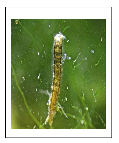
Gills and air bubbles were notice. Thus my imitation of that a Green Gilled Midge with Gills and an air bubble.