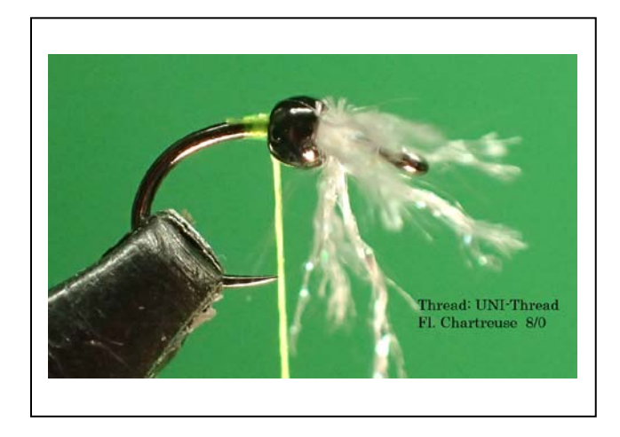
Tie the thread behind the bead to keep it in place and pushing against the thread and glass bead.