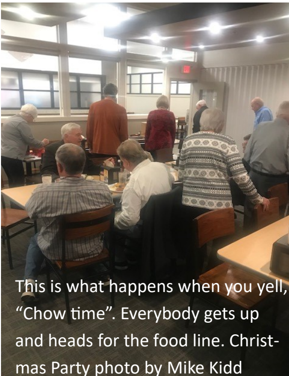
This is what happens when you yell, "Chow time". Everybody gets up and heads for the food line. Christmas Party