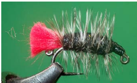
Woolly Worm on a 1/64 Double eye hook

Let me know what you think. dmstead@aol.com