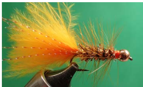
The Chili Pepper Fly