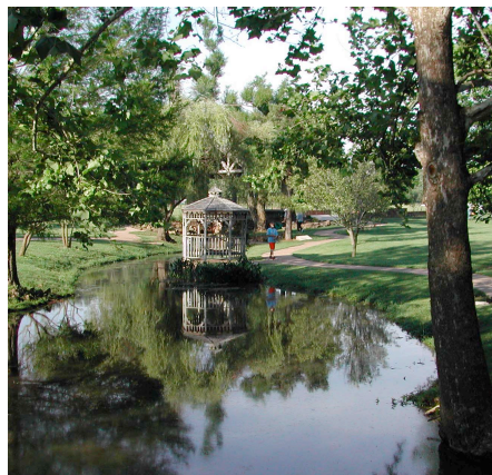
A view from Jolly Mill